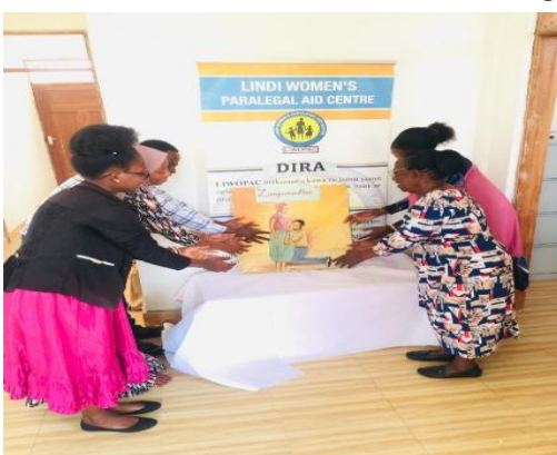
Figure 2. LIWOPAC team with shined photo during inauguration of “ZungumzaNae” Campaign conducted at organization main Office Lindi Municipal

LIWOPAC officially launched the “ZungumzaNae” Campaign in May 2024 at its headquarters in