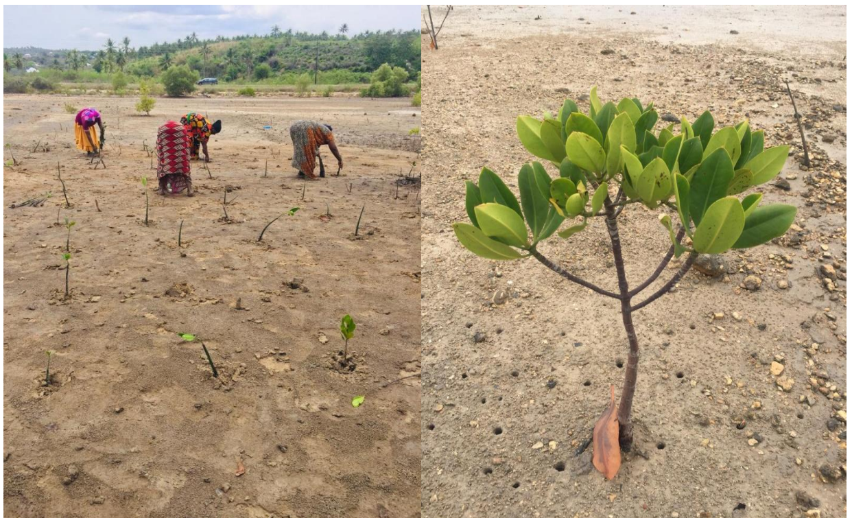
Figure 3. LIWOPAC youth team performed Mangrove restoration in process at Msinjahili Ward Lindi Municipal